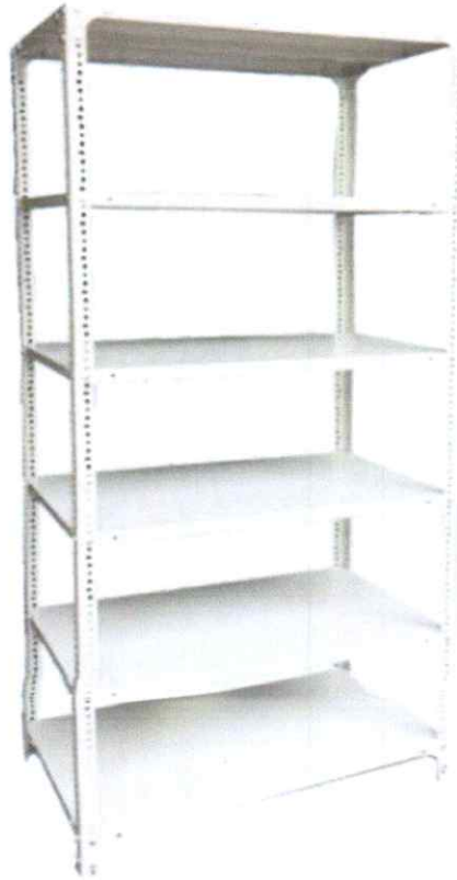
Heavy Duty Steel Rack Storage